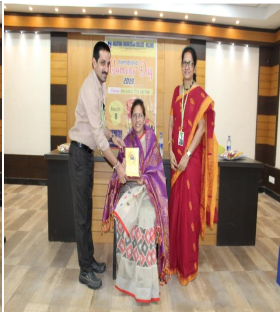
Felicitating the chief guest