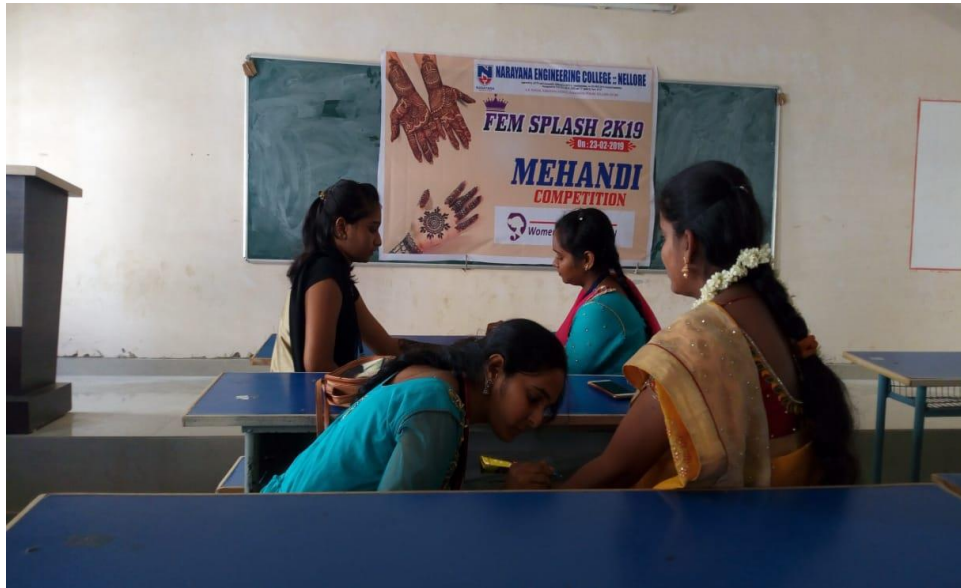
Participants in Mehandi