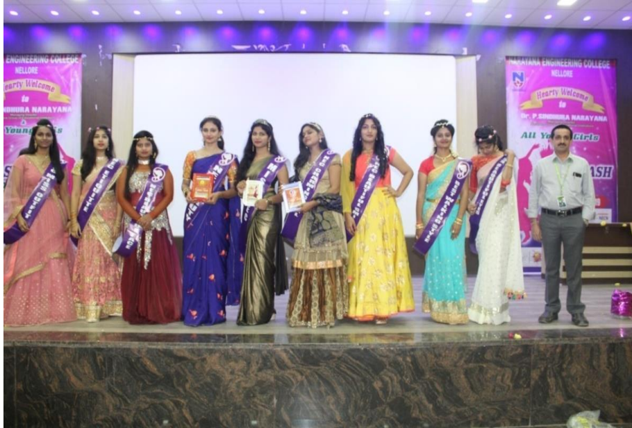
Participants in fashion show