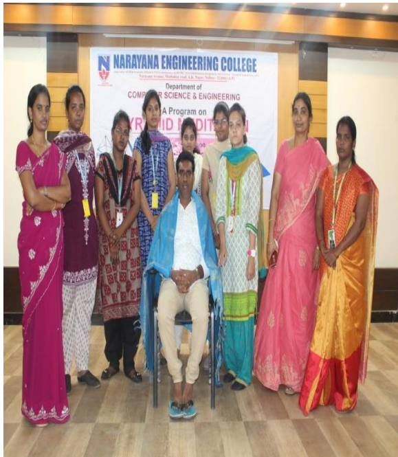
Felicitation to the chief guest