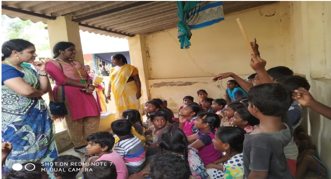
Sharing Their Views With Our Girl Volunteers