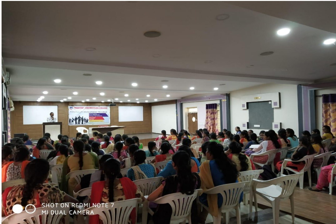
Activity oriented program on personality development