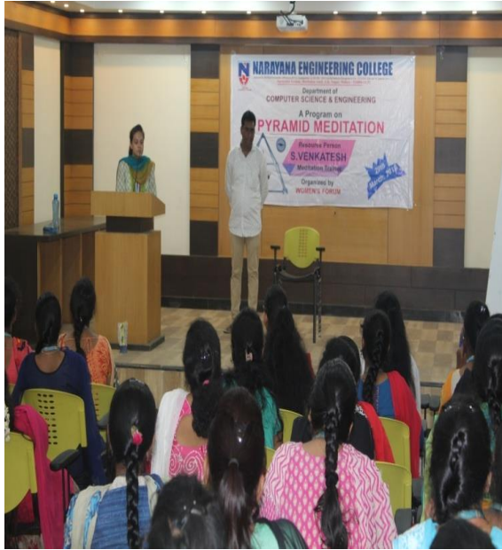
Introducing chief guest