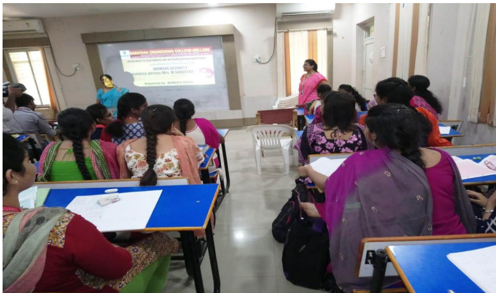
Resource Person giving tips about security