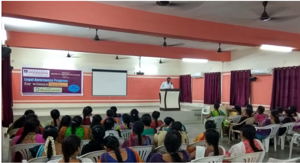
Students were attended in the session