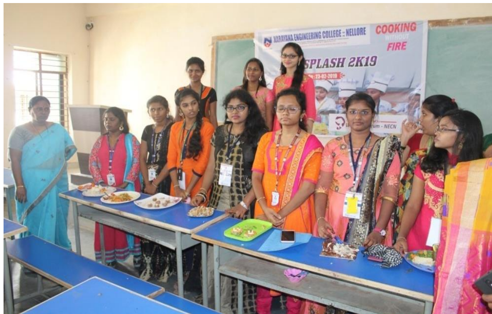
Participants in cooking without fire