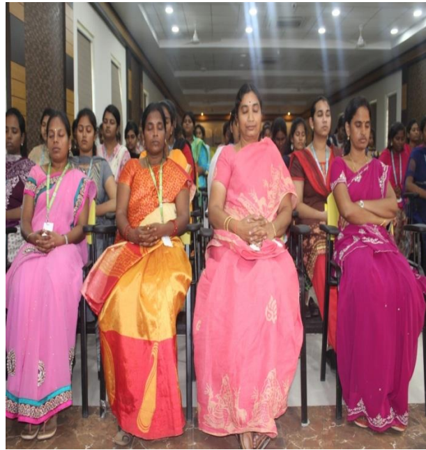
Students and faculty doing meditation