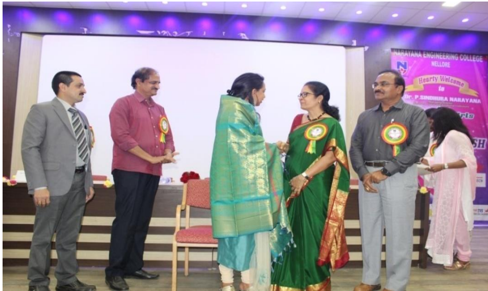
Felicitation to the chief guest