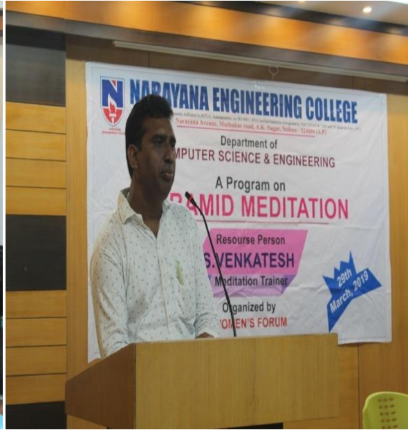
Addressing the gathering