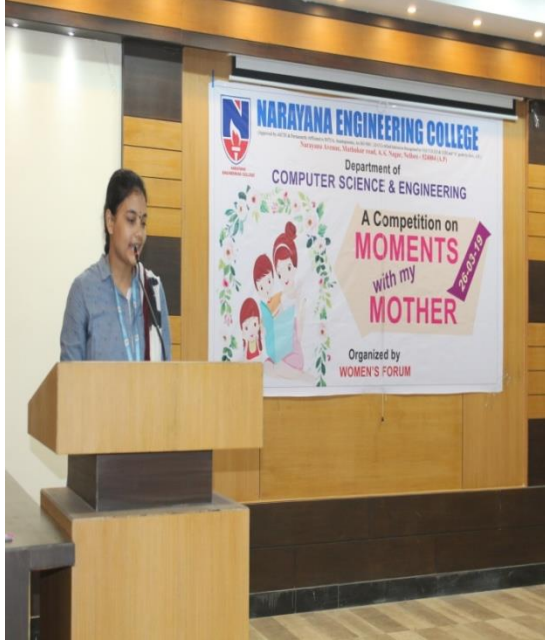
Student giving welcome note to audience