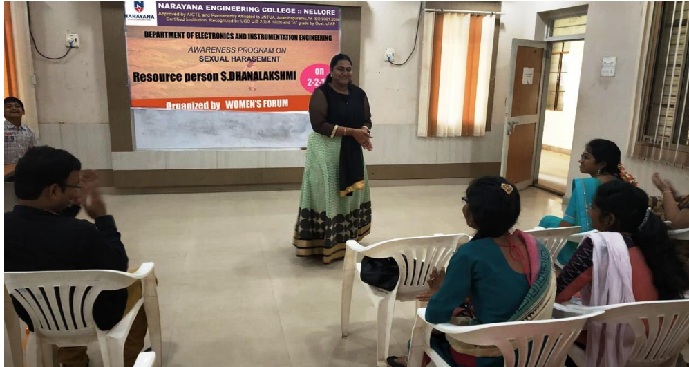
Resource Person addressing the gallery