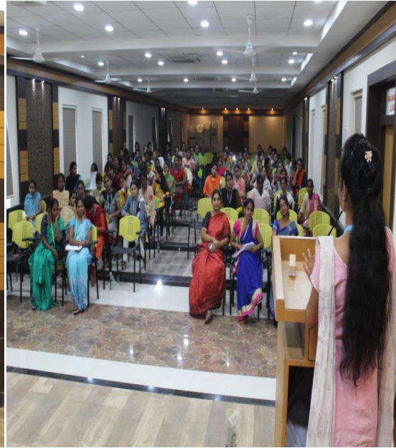
Speech given by the student