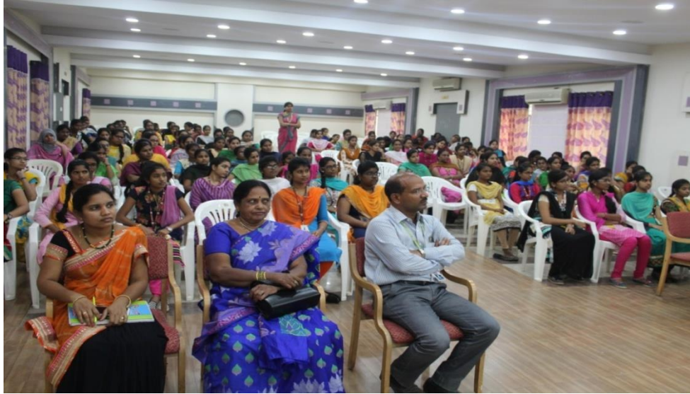
Audience in the auditorium