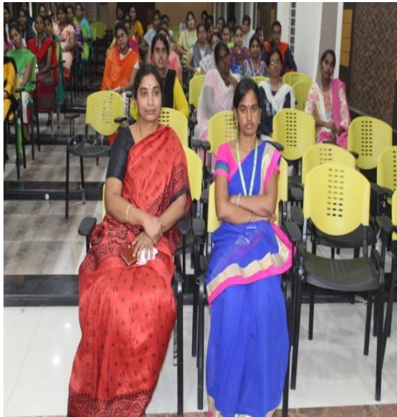
Audience in the auditorium