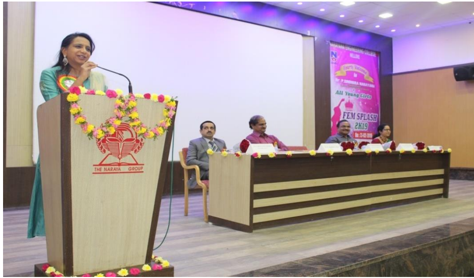
Dignitaries on the stage