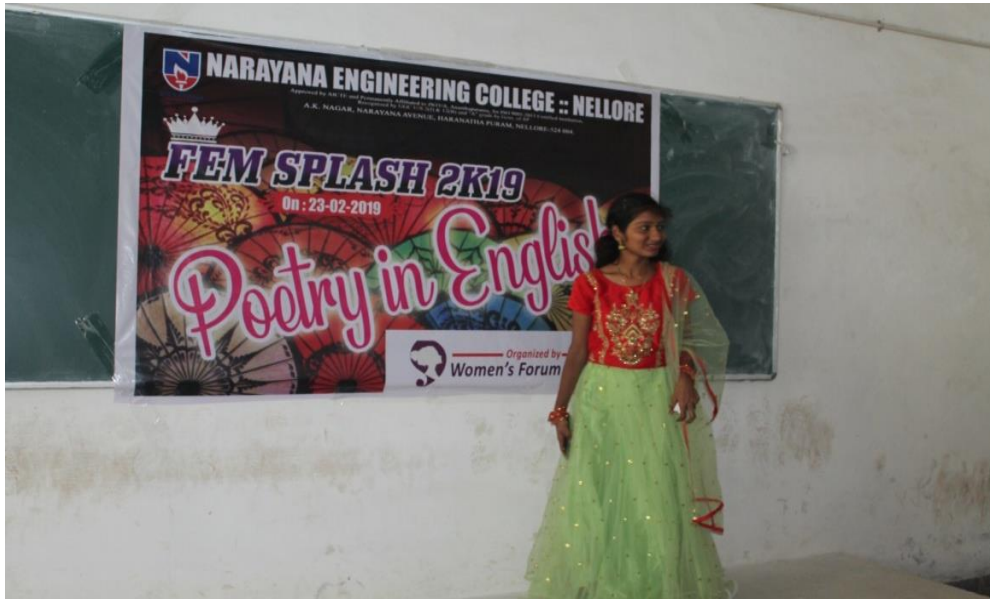
Participants in Poetry in English