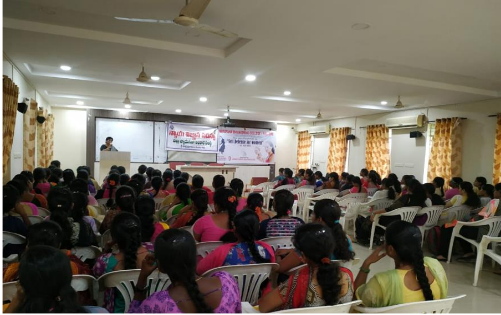
Audience listening to the speech