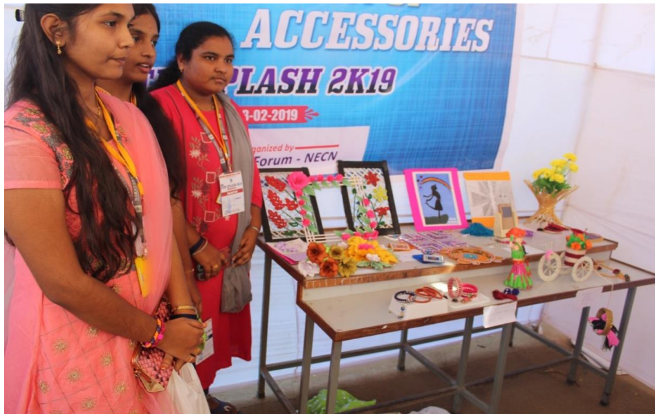
Participants in Making of accessories