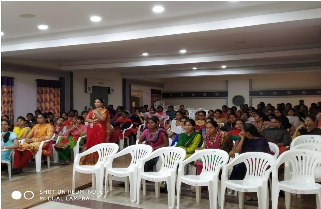
Enthusiastic listeners of the lecture