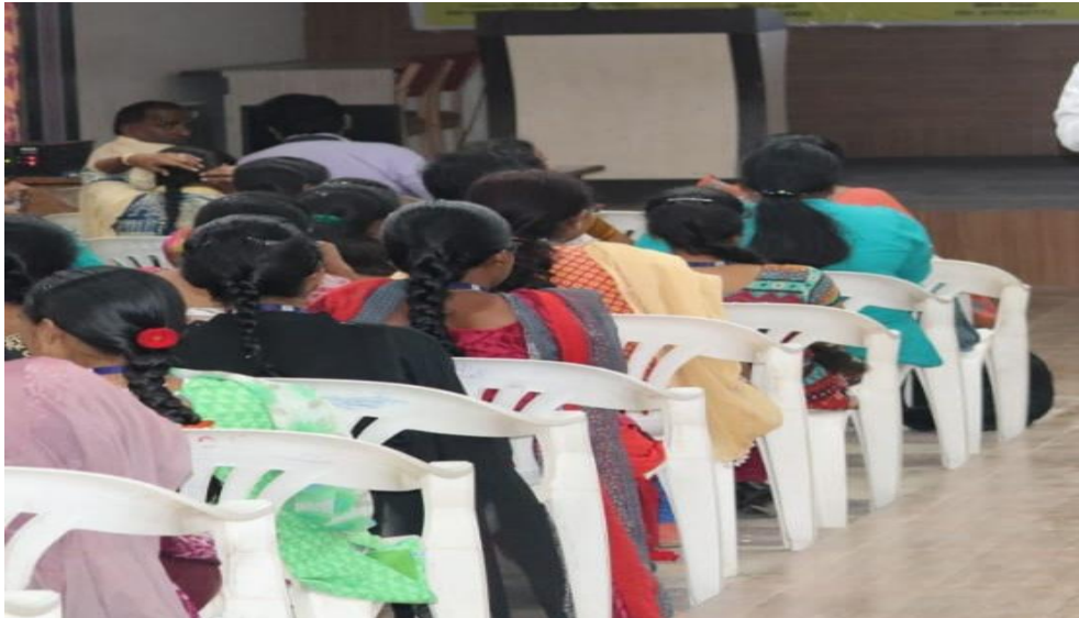
Audience listening to the speech