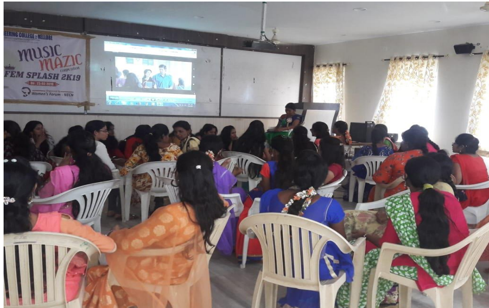
Participants in music mazic