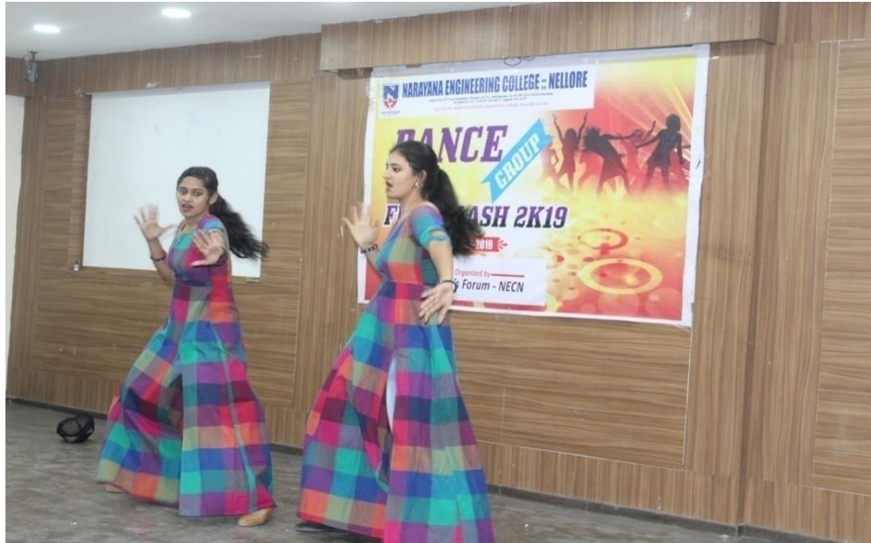
Participants in Group dance