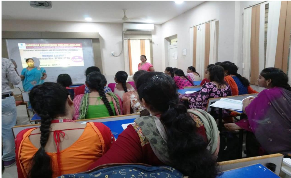
Resource Person addressing the gallery