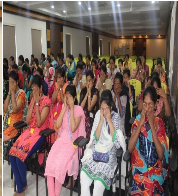
Students doing activities