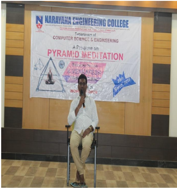
Chief guest giving training