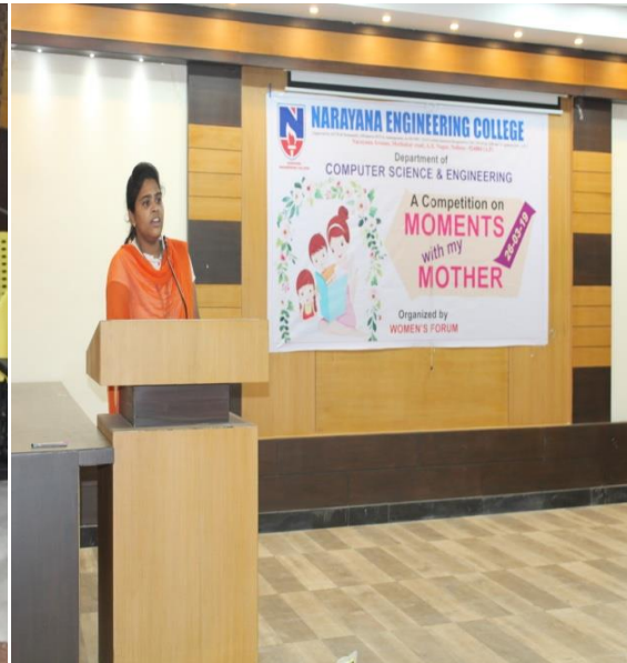
Student talking about moments with her mother