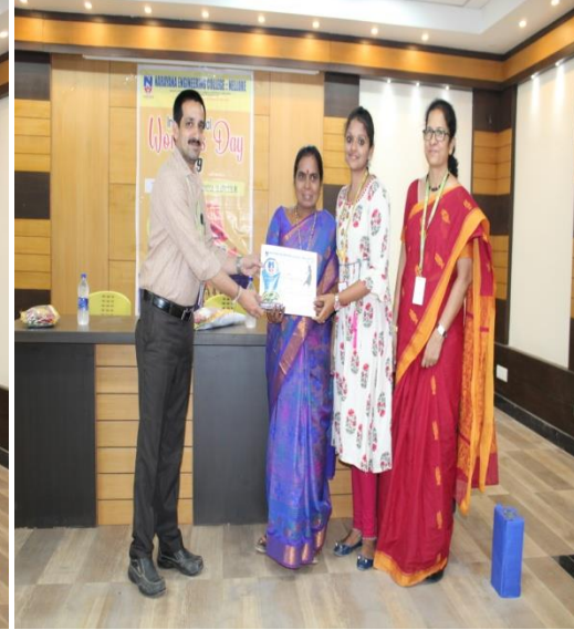
Distribution of certificate and memento for girl students