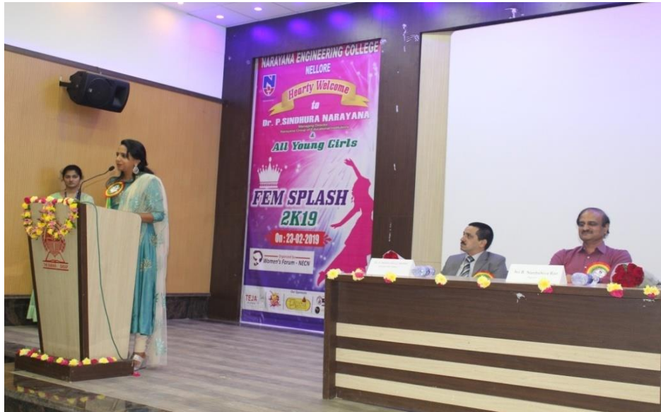
Speech by chief guest