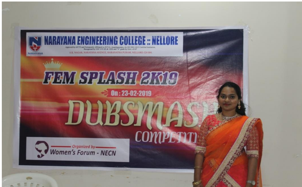
Participants in Dubsmash