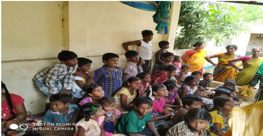
Interacting with each and every child