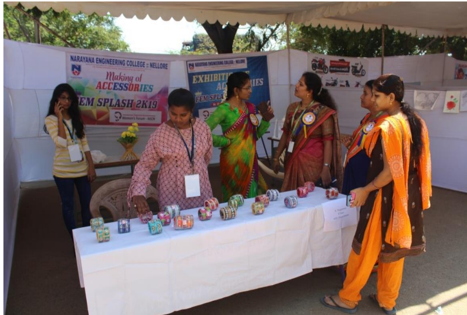
Participants in Making of Accessories