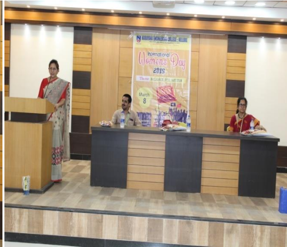
Chief guest Addressing the Gathering