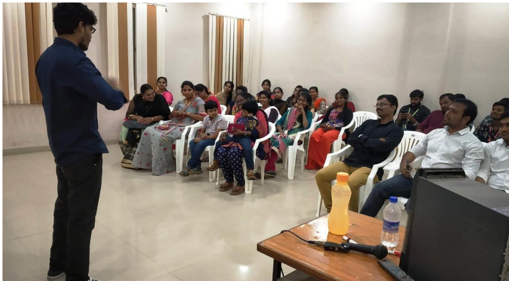
Interaction among students and resource person