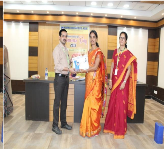
Distribution of certificate and memento for staff members