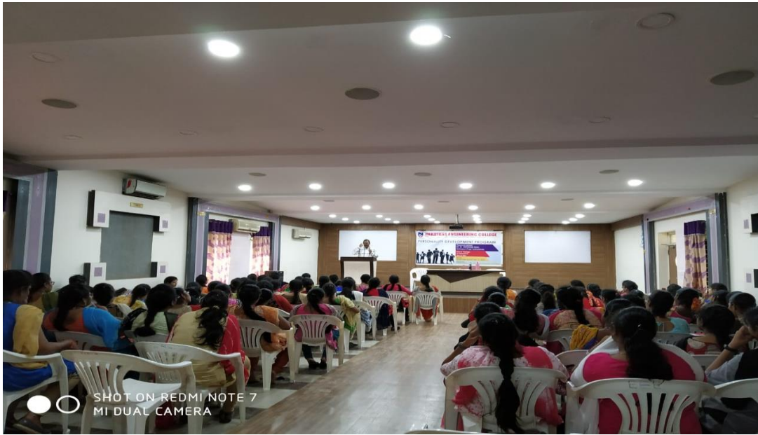
Teaching about personal development