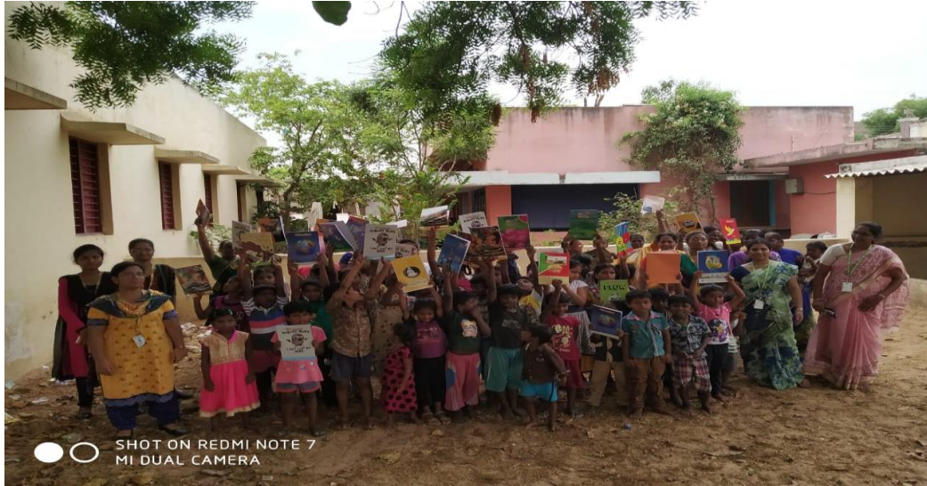
Books Distribution to Children