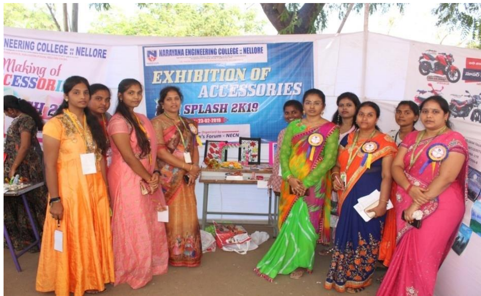
Group photo of Participants in Exhibition of accessories